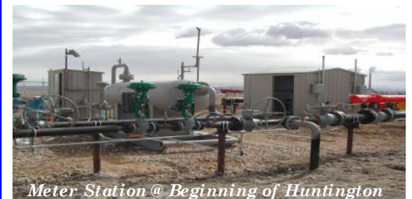
Meter Station @ Beginning of Huntington

• FERC, DOT, ASME, PSC compliance • Piping