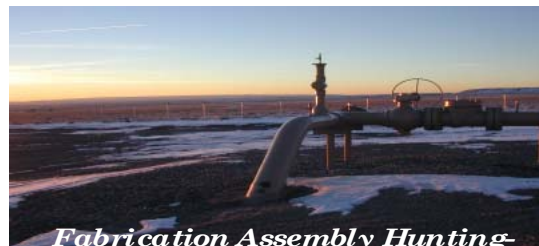
Fabrication Assembly Huntington

Oil & Gas Development: • Archeology coordination • BLM road staking, design and permitting • Environmental permit (EA/EIS)