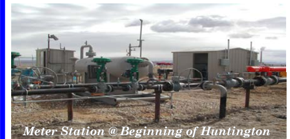
Meter Station @ Beginning of Huntington

Pipeline & Facilities Engineering: ● Route selection ● Pipeline alignment maps ● P.O.D. maps ● Crossings and spans ● Pig launcher/receiver facilities ● Slug catchers & condensate recovery ● Internal inspections & testing ● High voltage interference ● Block valves ● ESD facilities ● Tie-in facilities ● Metering and flow quality monitoring ● Pressure and flow control ● Mechanical design ● Civil design ● Structural design ● Line pipe, valves, fittings and fabrication parts ● Planning and scheduling ● Contract documents and bid forms ● System audits ● Rehabilitation analysis ● Preliminary geotechnical investigations ● Land slide and slope stability mitigation ● Stream erosion mitigation ● FERC, DOT, ASME, PSC compliance ● Piping and instrumentation diagrams ● Hydraulic, surge & drain down analysis ● Pressure vessel and process equipment ● Buildings ● Operation/maintenance manuals.