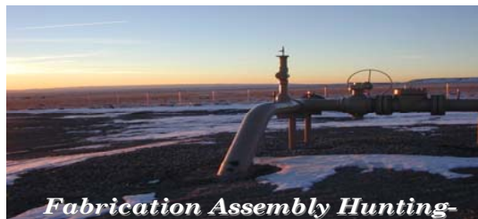
Fabrication Assembly Hunting-

Oil & Gas Development: ● Archeology coordination ● BLM road staking, design and permitting ● Environmental permit (EA/EIS) exhibit preparation ● Site specific or field area planning, permitting, design and construction management to support APD approvals.